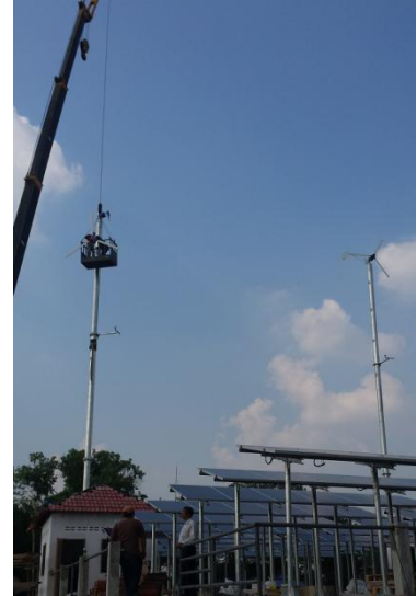
Super vision by Fortis Wind Energy & Independent Energy engineers upon commissioning by our local partner