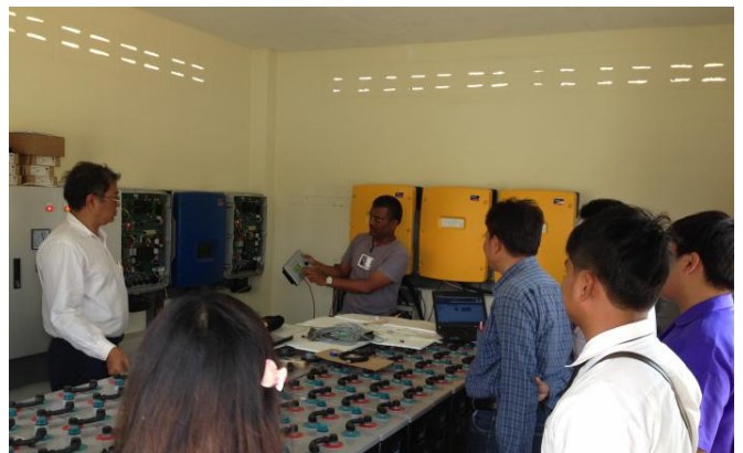
Training & Instruction for end users