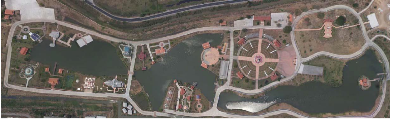
2 systems located in the place Taling Chan & 3 systems in the place Han Tra

The 5 Hybrid Systems are divided over 2 sites near the city Ayutthaya: