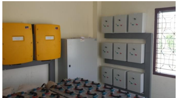
AC/DC distribution cabinet & Timer control

Total consumption per site is 60 kWh per day