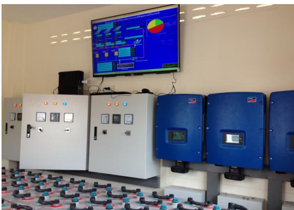
Data monitoring via Webbox

Total consumption per site is 60 kWh per day