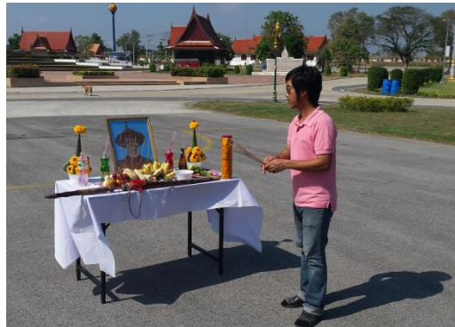
Traditional ritual at Project Completion