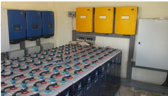
Battery Bank: 24 cells of 2 Volt type PVS4940 3x SMA STP inverter of 10 kW 3x SMA Sunny Island type 6.0H

The systems are used to power water treatment: