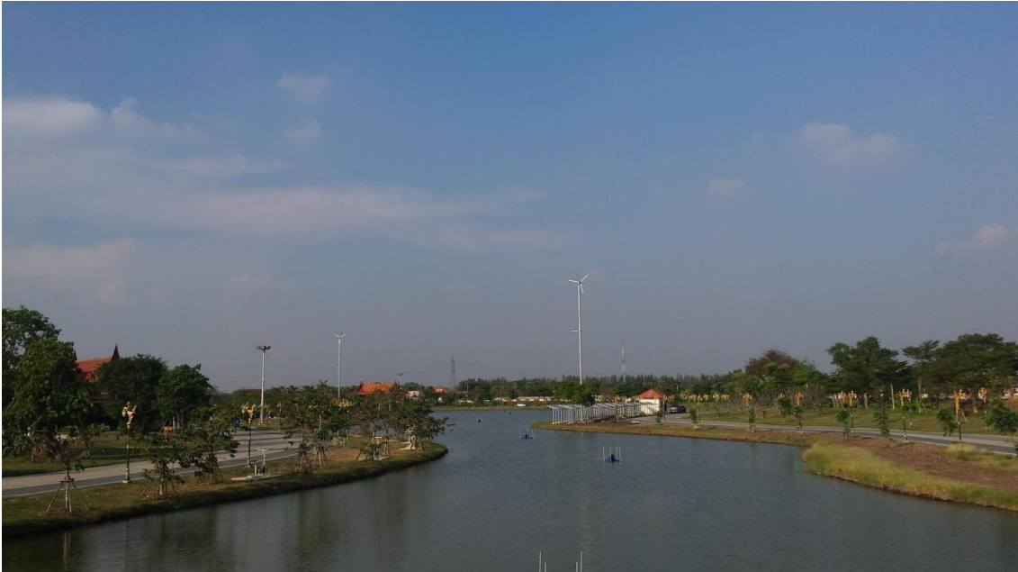
Site view: of the application in Taling Chan

In February 2015 “Fortis Wind Energy” & “Independent Energy” from The Netherlands together with our hardware distributor and automation partner in Thailand we completed 5 (five) Hybrid Systems of 32 kWp each in the province Ayutthaya, Thailand. The Hybrid Systems are used for water treatment.